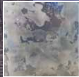
Hit & Miss