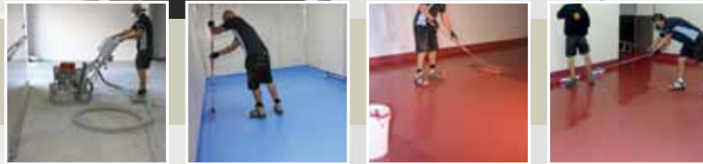
Preparing new floor for a meat processing plant and coating with SV100

For more design ideas visit our website www.on-crete.com.au